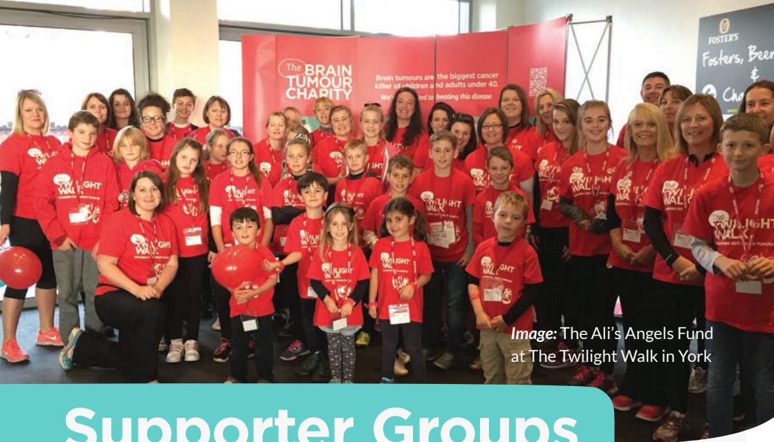
Image: The Ali's Angels Fund at The Twilight Walk in York