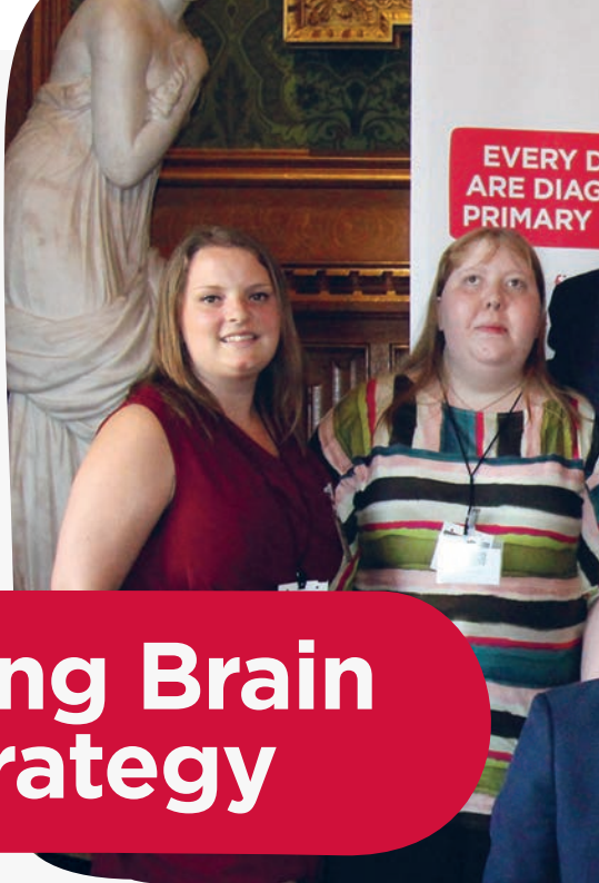
Image: The Young Ambassadors with our patron, Tom Daley at the launch of our strategy in the House of Lords.